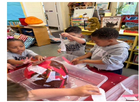
Pre-K: Gardening and creating piñatas from recycled materials