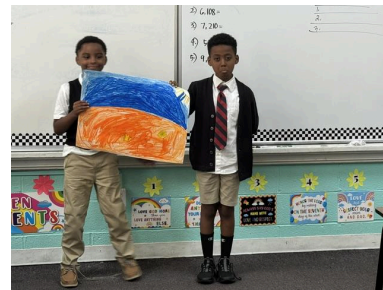
Third Grade making presentations how cycles make an impact.

With gratitude, Annunciation Catholic School Faculty