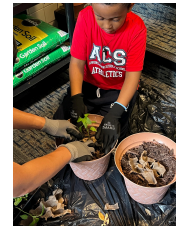
Kindergarten & First Grade with the environmental club creating a garden at the school.